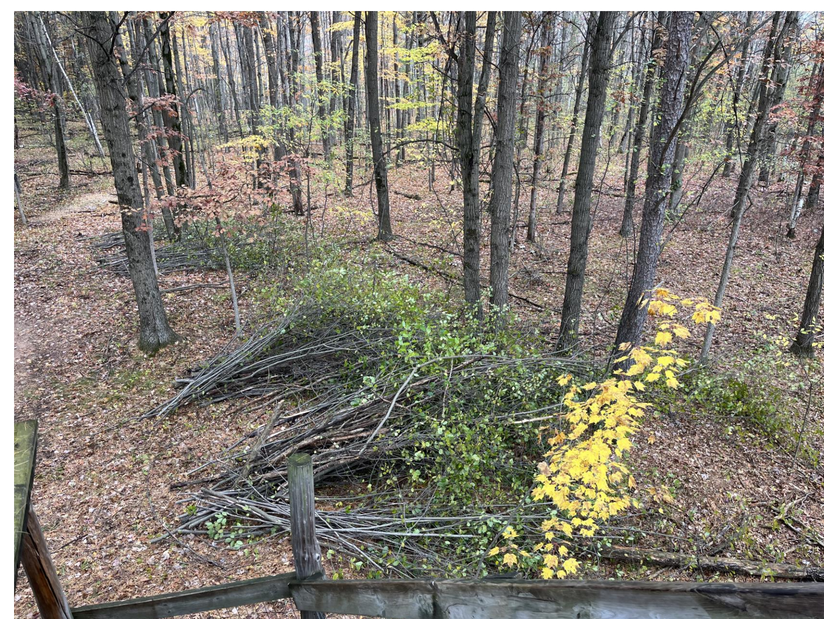
Fig 1. Buckthorn piles after the Fall 2022 Restoration Celebration in Trail of Reflections