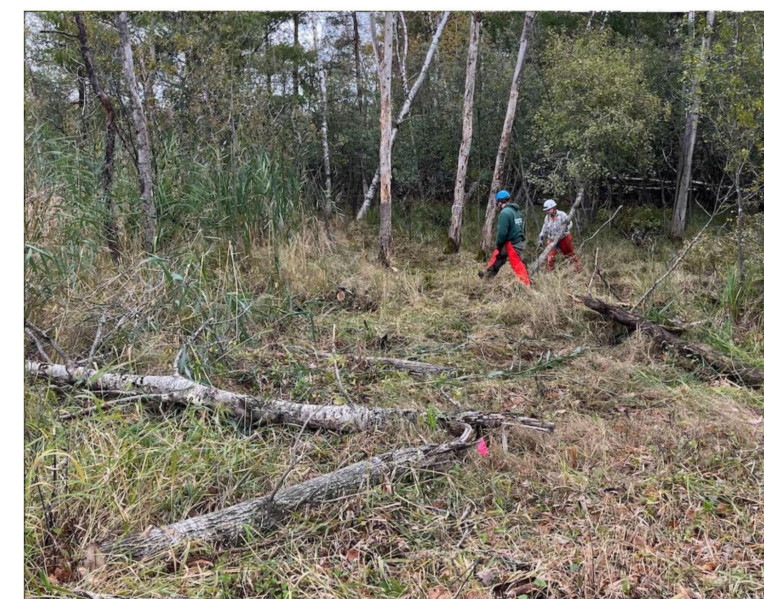
Fig 2. Stewards at the Fall 2023 Restoration Celebration create a fire line in Memorial Pond